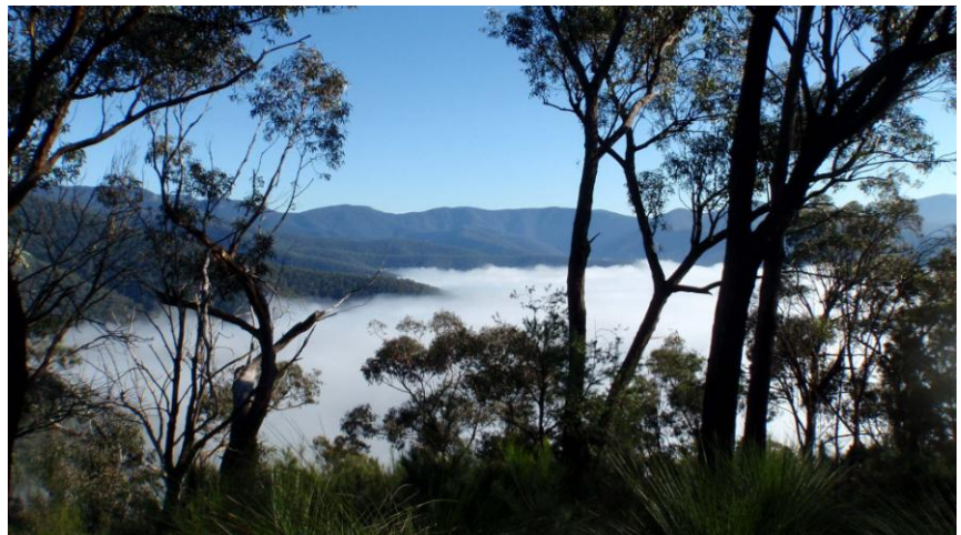
Above: Morning mist, Morning ascent of Burkes Hill, NSW