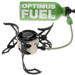
Optimus Nova Stove

If you have an Optimus Nova/Nova+ Multifuel Expedition Stove purchased between January 2009 and September 2010 it is in your best interest to take advantage of the voluntary recall of such products. The stoves in question have a black burner housing and shows a QA – number from QA000011-QA007313. The Optimus cookers are being recalled due to: a manufacturing defect that may damage the O rings causing leakage. The O-rings in the fuel hose and in the ON/OFF valve on some stoves can expand with the use of certain types of fuel. As a result some Nova stoves of the latest production lots may have fuel hoses that are not completely crimped and could detach. To file a recall claim click on the following link: Nova Stove Recall Claim